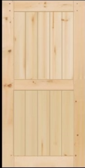
MID - RAIL