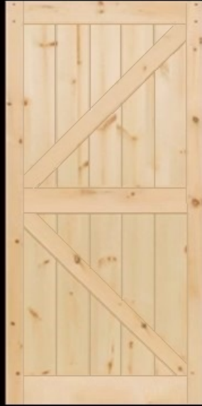
K (MID - RAIL)