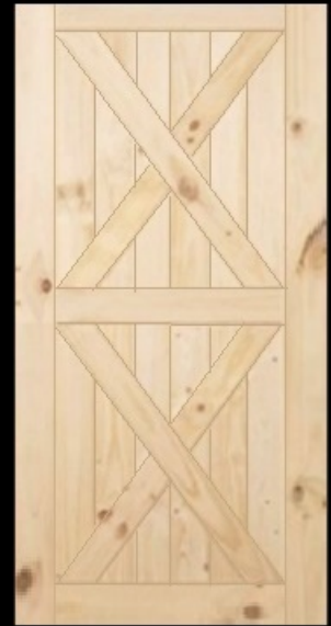
DBL X (MID - RAIL)