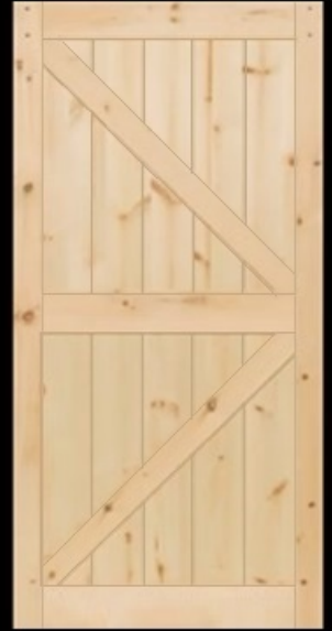
REV K (MID - RAIL)